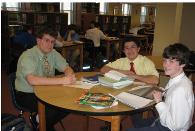
Don't like studying alone? Then study with your friends!

000 General 010 Bibliography 070 Journalism, Newspapers 330 Economics 342 Constitutional History