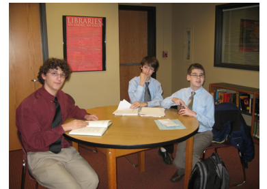
After school, the library is a great place to do homework.