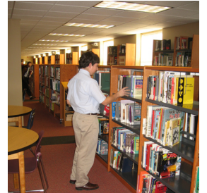
There are a lot of books!

A few of the student members of the Library Advisory Committee