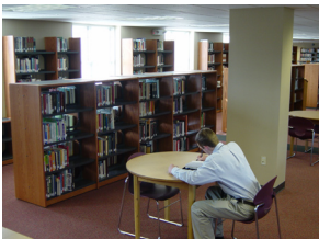
The library is a great place to study.