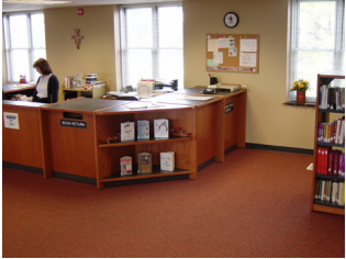
The library is open throughout the entire school day.

Here are some pictures from around the library