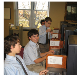
Anyone can come in and use the library!